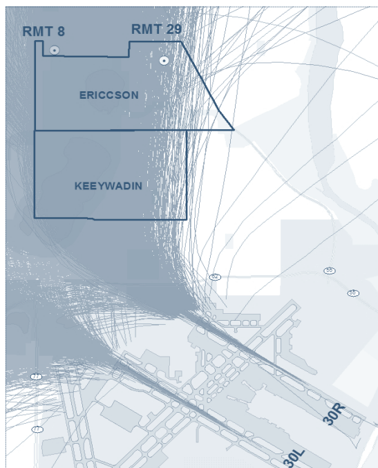
Flight tracks for Jan. 1—Aug. 28, 2011 over affected neighborhoods

The NOC discussed these trends with the FAA and City of Minneapolis officials during its meeting on November 16, 2011. At that time, the FAA reported it