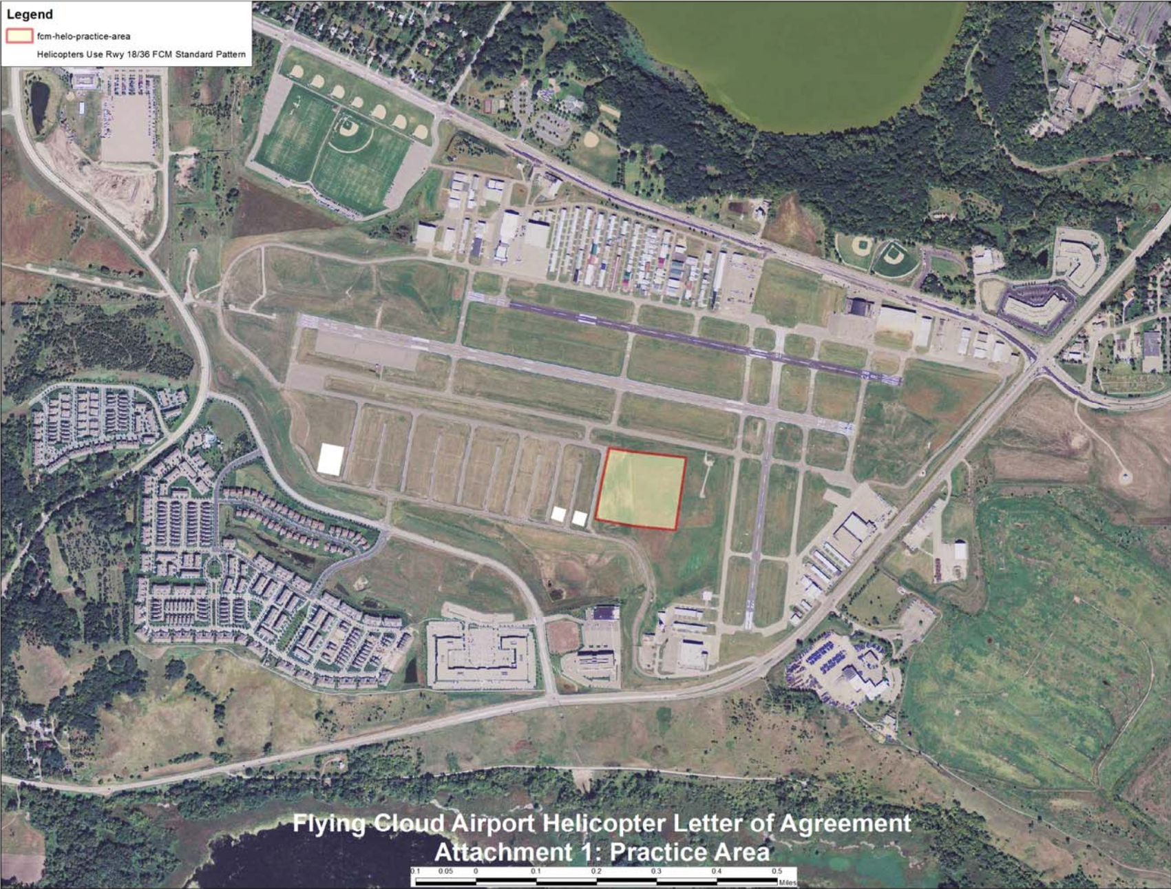
Flying Cloud Airport Helicopter Letter of Agreement Attachment 1: Practice Area